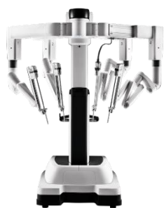
Da Vinci Xi surgical system

a surgeon starts a procedure using a da Vinci surgical system