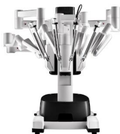
Da Vinci X surgical system