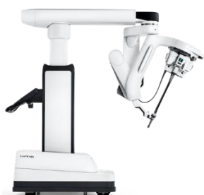
Da Vinci SP (Single-Port) surgical system