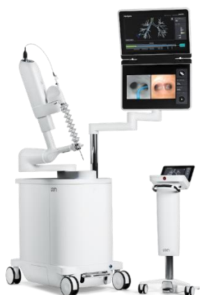
Ion endoluminal platform

We continue to collect clinical data through ongoing clinical studies in hospitals throughout the United States. These studies may provide us with additional insights as to how Ion can further assist physicians in achieving lung nodule biopsies.