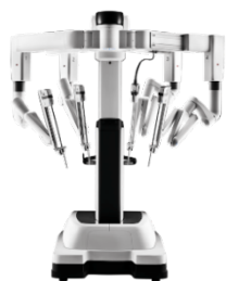
Da Vinci Xi surgical system

a surgeon starts a procedure using a da Vinci surgical system