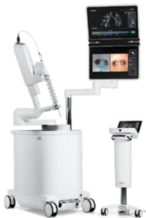
Ion endoluminal platform

We continue to collect clinical data through ongoing clinical studies in hospitals throughout the United States. These studies may provide us with additional insights as to how Ion can further assist physicians in achieving lung nodule biopsies.