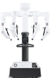
Da Vinci 5 surgical system